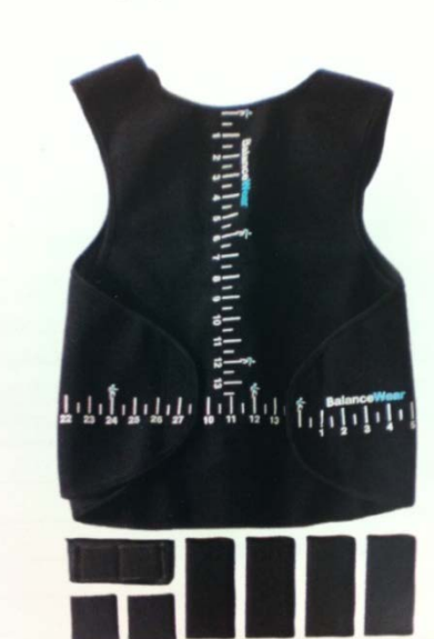
Figure 1. BBTW™ Garment and Weights